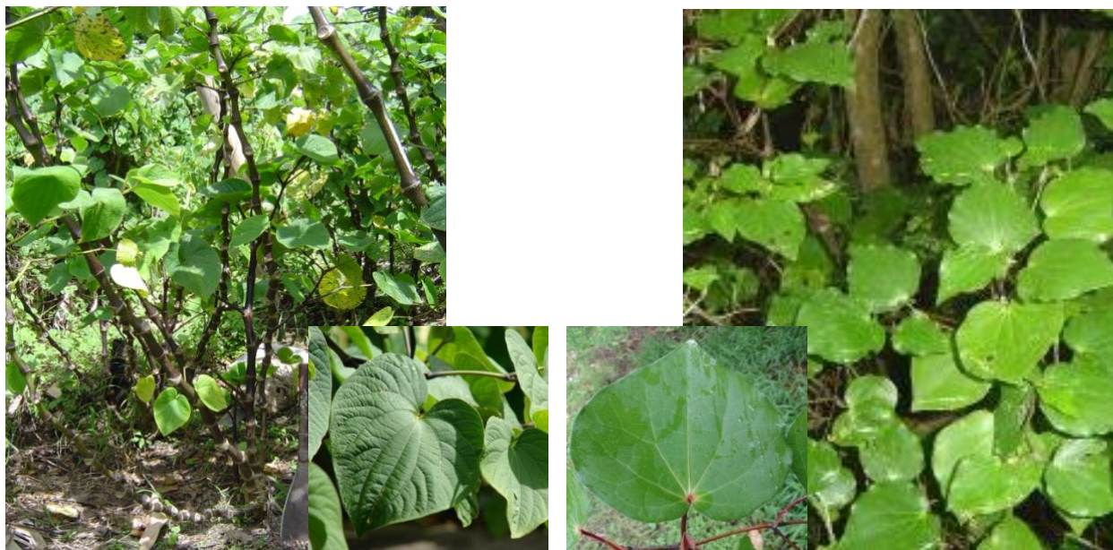
Figure 1 Kava – Piper methysticum (left) and the Aotearoa/New Zealand native kawakawa – Macropiper excelsum (right) (Aporosa, 2016).

Kava grows in warm tropical conditions, is uprooted from three years of age and the roots are washed. In a few areas of Papua New Guinea, Pohnpei and Vanuatu, the freshly harvested roots are usually ground into a wet pulp and then mixed with a small quantity of water to make an extremely strong aqueous beverage. In Fiji, Tonga and Samoa, it is more common to first dry the roots, then pound them into a powder which is used to make a drink of less strength (Oliver, 1989, pp.301-2). Kava consumed in A/NZ is mixed using dried and pounded kava powder which is brought into the country as kava will not grow in A/NZ due to the climate (Singh, 2004, p.56).