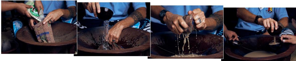
Figure 3 Mixing kava following its presentation in Auckland, Aotearoa/New Zealand.

It is also common to present kava when you visit a village or house (Arno, 1985, p.130). Following the presentation, which consists of a speech that might also include requests, apologies, prayer, the acknowledgement of those who have passed on, stories, proverbs and anecdotes, the presented kava is then mixed and drunk to bring about mutuality and equality between presenter and recipient. Figure 3 shows the mixing of kava following presentation in Auckland, A/NZ. It is believed that it is through the final act of sharing and consuming this kava that the mana possessed by the kava is transferred between host and guest, resulting in the removal of tabu or tapu (sacredness, separation) (Brisson, 2001, p.331). This would suggest that early Pacific voyagers would have also carried kava with them to acknowledge those they met along the way, aiding hospitality and assisting resupply for ongoing travel.